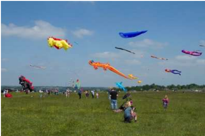
Plenty of Space for All