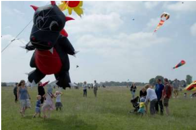
Children making friends with “Dino”