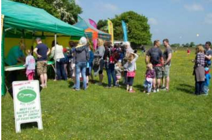
Customers for the Hardworking WHKF team

All in all then, a perfect days flying .....probably.