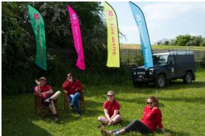
The NT Team taking a well-earned breather

All in all then, a perfect days flying .....probably.