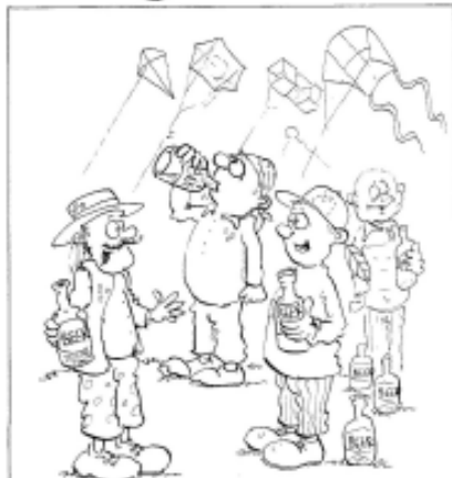
WHAT MY WIFE THINKS I DO