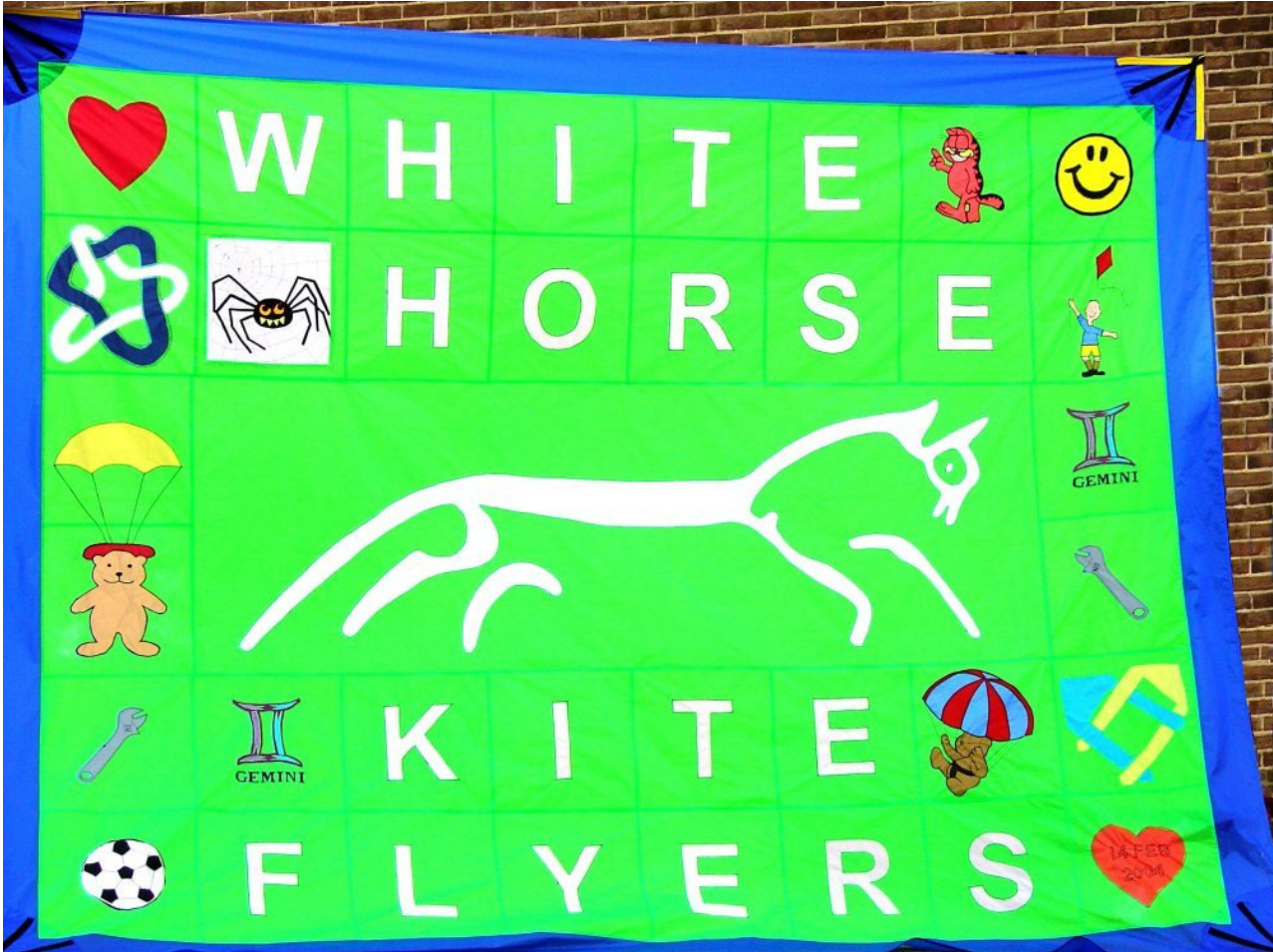
The Club's Playsail