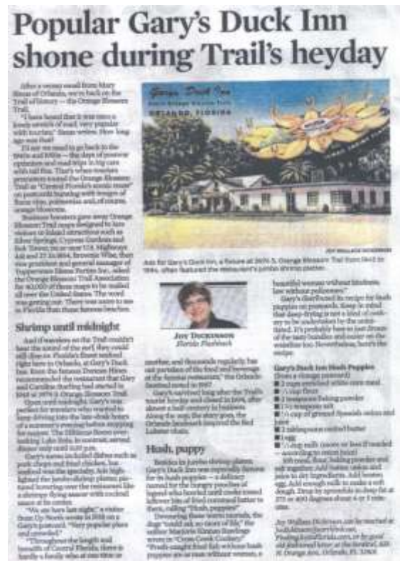
...yes it is a silver plated flying pig...

Planning to be at Convention in Ocean City? If you are interested in staying on the boardwalk with super convenient parking, Angel would like to hear from you! Call the Shoreham Hotel (800- 926-7972 or 410-289-7972) Ask to speak to Angel Conner. She is in at least once a day, but not always at the same times. If enough kilters are interested in staying at the Shoreham, Angel will work with the owner to stay open for us that week!